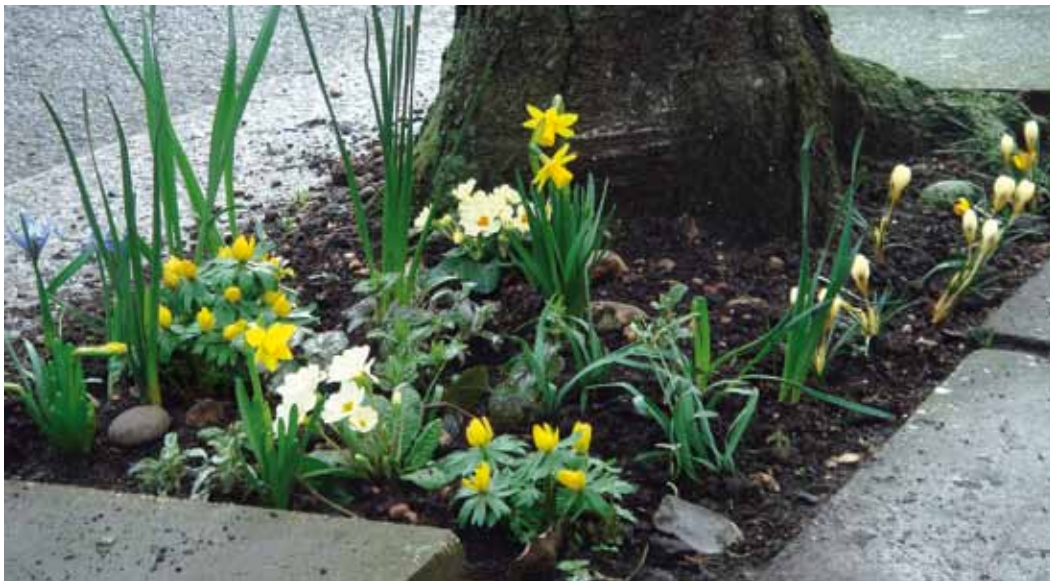
Primroses, crocuses and miniature daffodils heralding spring