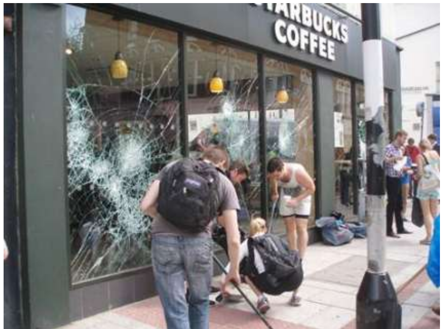
The big clean up begins on St John's Road

by weeding, clearing and helping plant vegetables on Saturday mornings. She has set up a Justgiving page to raise money for charities working with young people.