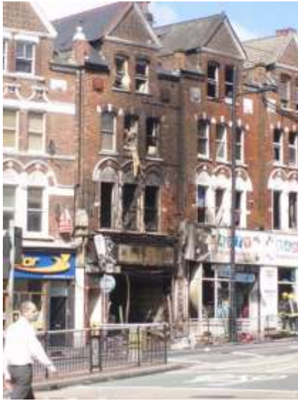
The devastated Party Shop and flats

The damage and the clean-up operation in pictures