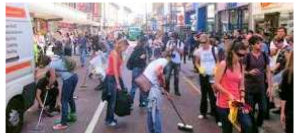
The Battersea broom brigade in action