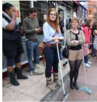
Waiting to get started