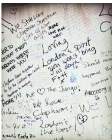
Messages on the boarded-up window of TK Maxx