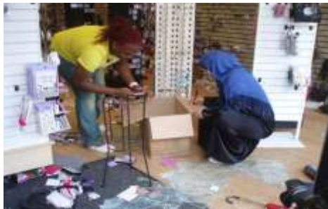
Store staff sort through the wreckage