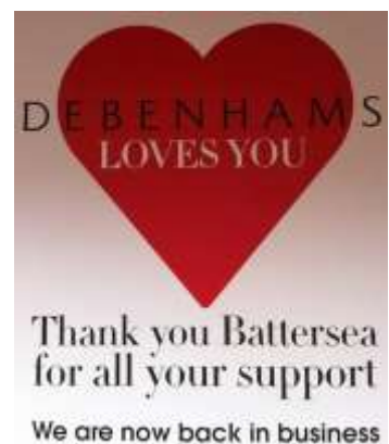
Poster in the re-opened store