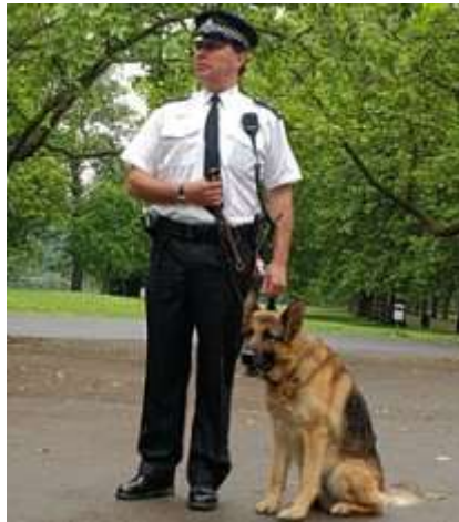
A Parks police dog-handler on duty

In 1985 Wandsworth Council established the Parks Police Service to manage the Open Spaces of Wandsworth. In Battersea, this is primarily Battersea Park, but it also includes all the other smaller parks and spaces across the borough. For a quarter of a century this service has been a quiet but resounding success. Quiet because those residents and visitors who do not use the parks and commons have probably never heard of the service. Resounding because those who do, hold the service and its individual officers in high regard for the work they do in keeping our open spaces safe and tranquil.