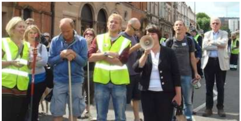
Jane Ellison MP lets the crowds know that the clean-up can begin