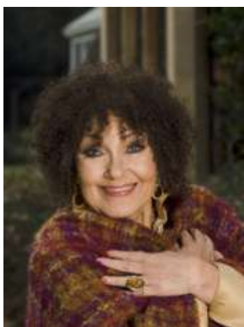
The inimitable Cleo Laine

"I've had an incredibly fortunate career. I started off as part of the team at the London Borough of Greenwich helping to run the festival there. Then I was planning manager at the Barbican for 15 years since before its opening up to the mid 90s. It developed from a white elephant into one of the world's major arts venues and it was very